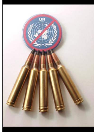
DON'T FIRE TILL YOU SEE THE BLUE OF THEIR HELMETS.