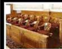
...the jury box,