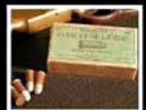
...and the cartridge box.